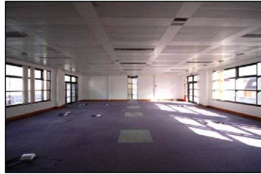
NB – Above photographs are typical upper floors of 28 Brunswick Place.