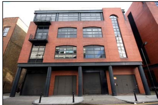
NB - Above photographs are of 28 Brunswick Place

THESE PARTICULARS DO NOT FORM PART OF ANY OFFER OF CONTRACT. THEY ARE ISSUED AS A GENERAL GUIDE, BUT DO NOT CONSTITUTE REPRESENTATION OF FACT. PARTIES SHOULD SATISFY THEMSELVES AS TO THEIR ACCURACY. UNLESS OTHERWISE STATED, ALL PRICES/RENTS ARE QUOTED EXCLUSIVE OF VAT.