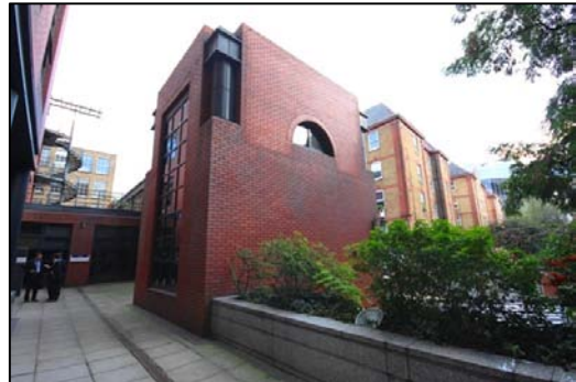
NB - Above photographs are of 5 Cranwood Street

THESE PARTICULARS DO NOT FORM PART OF ANY OFFER OF CONTRACT. THEY ARE ISSUED AS A GENERAL GUIDE, BUT DO NOT CONSTITUTE REPRESENTATION OF FACT. PARTIES SHOULD SATISFY THEMSELVES AS TO THEIR ACCURACY. UNLESS OTHERWISE STATED, ALL PRICES/RENTS ARE QUOTED EXCLUSIVE OF VAT.